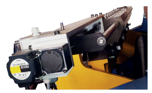
Automatic adjustment of the coating width

It can be used adhesives such as EVA, pressure sensitive and polyurethane. The ID LV Coating Heads are suitable also for high viscosity adhesives (from 1.000 to 100.000 mPas).