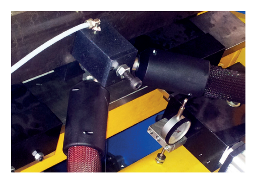
High flow feeding module for coating head